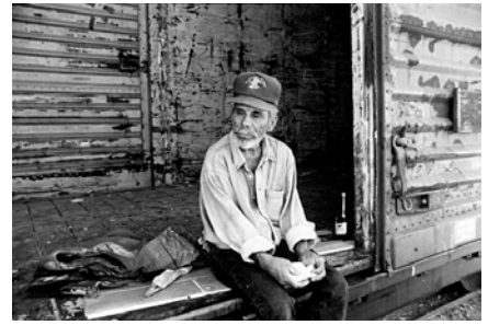
THE PAYCHECK, Calexico

Introduce students to the conditions facing migrant farm workers with a QuickTime video clip. Then guide them through the powerful contemporary photographs by Rick Nahmias in a PowerPoint presentation with companion handouts.