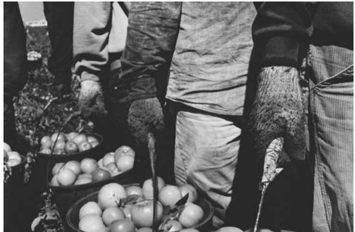
TOMATO PICKERS, Stockton

In the world’s richest nation, we are blessed with an abundance of food. Yet, many of the men and women who plant, pick, and package our fruits and vegetables live in poverty. Help your students connect to the food they eat with this powerful six-part curriculum from The Civics Center .